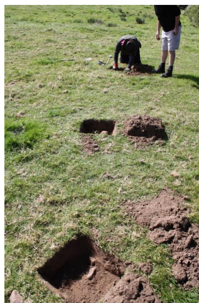
Left: Sondages Viewed to the west

At the bottom of the field, three small 30cm 2 x 15cm test-pits or sondages were dug but no substantial archaeology revealed.