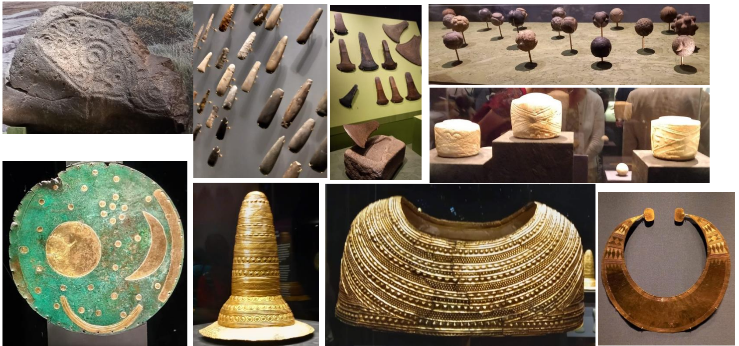
Clockwise from top left: Cup & ring marked boulder – product of boredom?; Stone axes from UK and Europe; Bronze axes and stone mould; carved stone balls from various UK sites; carved chalk ‘drums’ from East Yorkshire buried with a young child; gold lunula collar; gold cape from Mold, Wales; gold hat from Schifferstadt, Germany; Nebra ‘Sky Disc’ found near Leipzig, Germany – possibly some gold from S-W England. Bottom: 6000 old elm leaf from Windy Harbour- Skippool bypass dig, Wyre, Lancashire.

Its time scale ranged through the first farmers of the Neolithic, the Beaker People, the beginnings of metal working, through to fantastic artefacts of the Bronze Age and stunning examples of the artistry and skill of early goldsmiths and covered the practical day to day necessities to social and possible religious themes.