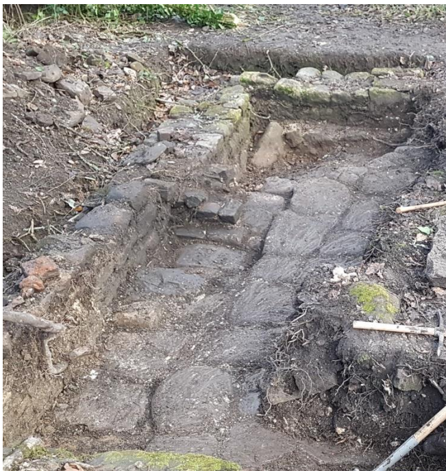
Kev's photo shows a paved floor by the north wall