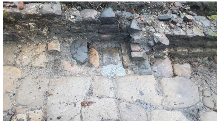
Above: Fireplace & hearth in north wall.