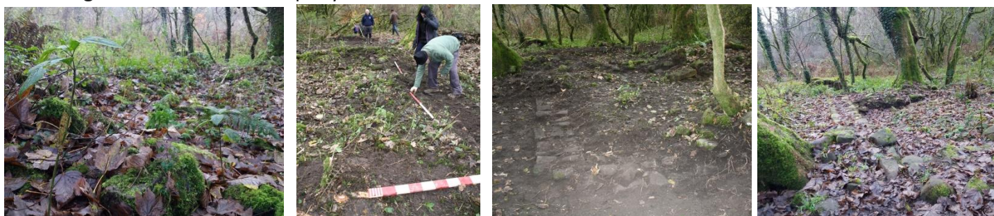
These photos show our site at Brock Bottom Cottage returning to archaeology. From left to right: a) 3 November 2019 before excavation; b) and c) November 2019 during the dig; d) 1 December 2020, photo taken at same spot as (a). What a difference a year makes!

How Archaeology Happens: How do things – buildings, artefacts etc – end up being ‘archaeology’? You can Google an answer to this and get the explanations about erosion, soil deposition and flooding events. Charles Darwin’s last book, published in 1881, gave a lot of credit to the action of earthworms, estimating that they can bring to the surface between 17 and 40 tonnes per hectare per year and that worm action can bury items to a depth of up to 2 metres. He also estimated that topsoil deposition was in the range of 2.0mm to 5.6mm per year.