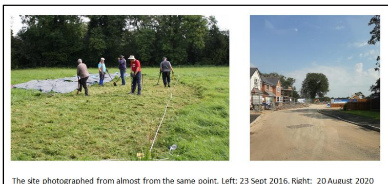
The site photographed from almost from the same point. Left: 23 Sept 2016. Right: 20 August 2020

We are now proposing to move to publishing more formal but non-technical dig reports in PDF format on the WA website but restricted to registered members of the society (i.e. recipients of this newsletter). Under this proposal