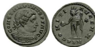
Constantine the Great AE-2 (22mm, 4.33g), London, Britannia (in present-day England), c. 312 AD, RIC VI 153. gVF.

This variety is distinguished from most other Constantine Sol/globus bronzes in two ways: Sol is holding the globus in his right, not left, hand (he holds a whip in his left hand), and the reverse legend leaves out the letters "SOLL." Interestingly, Helios, who was the Greek version of Sol, was often depicted on Greek coins holding a whip. In the mythology, Helios/Sol crossed the sky from east to west each day on his chariot, holding a whip.