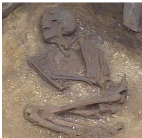
Former Norton Resident discovered and photographed by Yorkshire Water

their house being close to a Roman cemetery and maybe they could have a look under the garden decking but I didn't think they'd take my suggestion seriously.